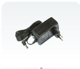
24 V 1.2 A power adapter