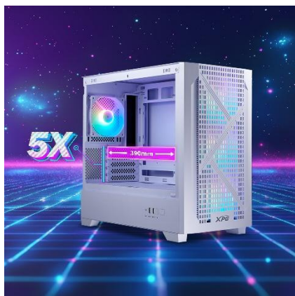
Supports Up to 390mm GPU