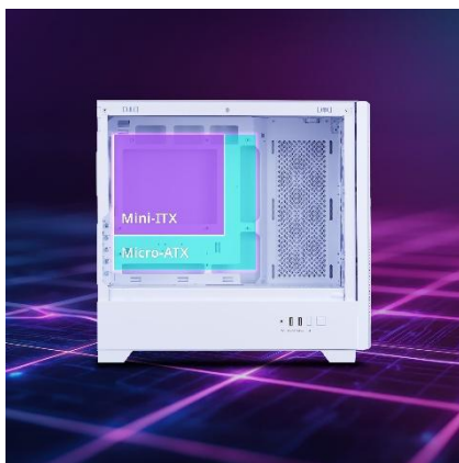
Compatible With m-ATX Motherboards