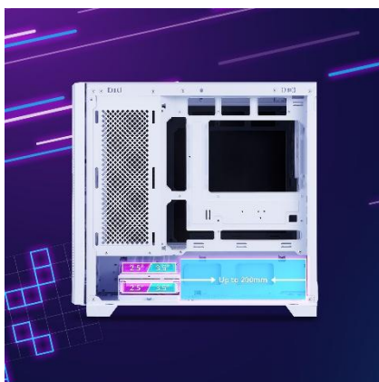
Smart Storage & Space to Grow