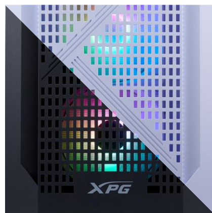
Grid-style Perforated Front Panel