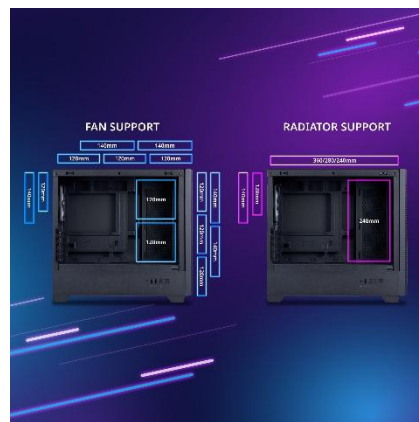
Flexible Cooling With Up to 360mm Radiator