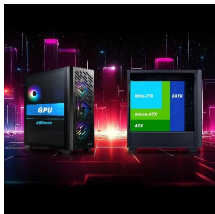
Supports Up To 400mm GPU And E-ATX