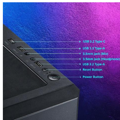
Versatile I/O Panel With Front USB-C