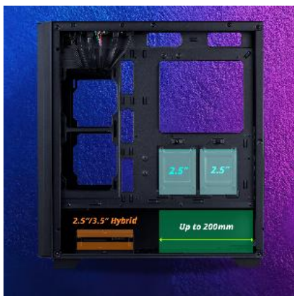
Up To 4 Drive Bays For Storage Expandability