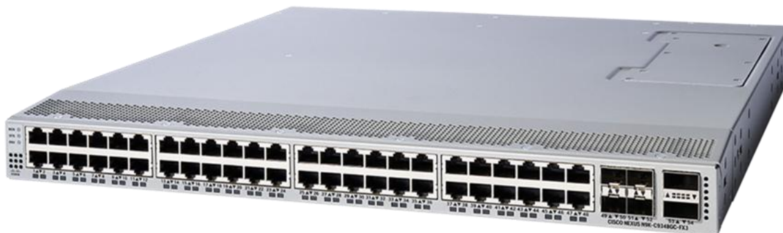
Figure 4. Cisco Nexus 9348GC-FX3 Switch

The Cisco Nexus 9348GC-FX3 Switch (Figure 4) is a 1RU switch that supports 696 Gbps of bandwidth and over 517 Mpps. The 48 1GBASE-T downlink ports on the 9348GC-FX3 can be configured to work as 10-Mbps, 100-Mbps, or 1-Gbps ports. The 4 ports of SFP28 can be configured as 1/10/25-Gbps and the 2 ports of QSFP28 can be configured as 40- and 100-Gbps ports, or a combination of 10-, 25-, 40, 50-, and 100-Gbps connectivity, offering flexible migration options.