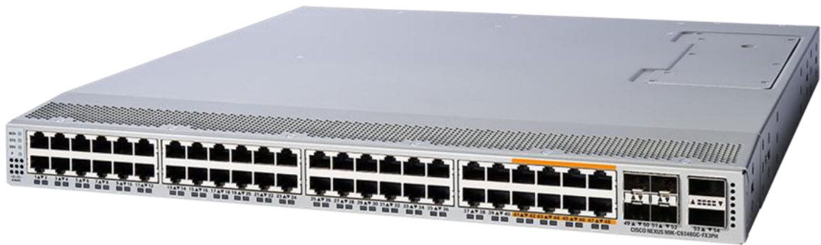
Figure 5. Cisco Nexus 9348GC-FX3PH Switch

The Cisco Nexus 9348GC-FX3PH Switch (Figure 5) is a 1RU switch that supports 696 Gbps of bandwidth and over 517 Mpps. The 40 1GBASE-T downlink ports on the 9348GC-FX3PH can be configured to work as 10-Mbps, 100-Mbps, or 1-Gbps ports. The last 8 downlink ports can be configured to work as 10-Mbps or 100-Mbps only. The 4 ports of SFP28 can be configured as 1/10/25-Gbps, and the 2 ports of QSFP28 can be configured as 40- and 100-Gbps ports, or a combination of 10, 25, 40, and 100-Gbps connectivity, offering flexible migration options. The last 8 ports are only half-duplex functionality and are limited to 10Mbps and 100Mbps speeds only. Supports power over ethernet. For details refer to Table 4.