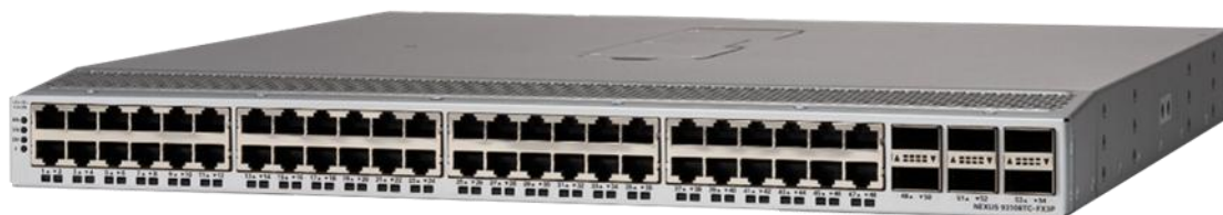
Figure 3. Cisco Nexus 93108TC-FX3P Switch

The Cisco Nexus 93108TC-FX3P Switch (Figure 3) is a compact 1 RU switch that supports 2.16 Tbps of bandwidth and 1.2 Billion packets per second (Bpps). Offering flexible port-speed configurations, the switch supports 48 ports of 100M/1/2.5/5/10G BASE-T on the downlinks. The 6 uplink ports support 40/100G QSFP 28. The 93108TC-FX3P is well suited for network customers requiring more versatility and flexibility in networking speeds. Supports power over ethernet. For details refer to Table 4.