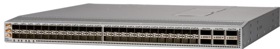
Figure 1. Cisco Nexus 93180YC-FX3 Switch

The Cisco Nexus 93180YC-FX3 Switch (Figure 1) is a 1RU switch that supports 3.6 Tbps of bandwidth and 1.2 Bpps. The 48 downlink ports on the 93180YC-FX3 are capable of supporting 1-, 10-, or 25-Gbps Ethernet, offering deployment flexibility and investment protection. The 6 uplink ports can be configured as 40 or 100-Gbps Ethernet, offering flexible migration options. The Cisco Nexus 93180YC-FX3 switch supports standard PTP telecom profiles with SyncE and PTP boundary clock functionality for telco data-center edge environments.