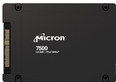
Micron 7500 NVMe SSD (U.3/U.2), 15mm

The 7500 SSD is a versatile solution that delivers the performance required by complex and critical business workloads.