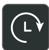
Ultra-long Battery Life