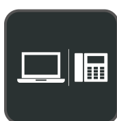
Multi-leading UC Platforms Compatibility