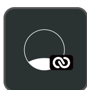
Flexible Daisy Chain