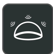
AI Noise Cancellation

The SP96 integrates 6 microphones and a 65mm speaker, utilizing advanced microphone technology and AI noise reduction to accurately pick up sound from any angle during calls, filtering out ambient noise and transmitting clear human voices. Combined with virtual bass technology, it enriches playback sound quality, delivering a premium audio experience. With an integrated liquid crystal display, it showcases a high-end appearance while intuitively displaying device status. Flexible cascade operation enables multiple devices to connect wirelessly, ensuring everyone in the meeting room can hear clearly. Its long battery life ensures prolonged participation and usage, and its multi-platform compatibility allows seamless use in work environments, providing users with a clear, immersive audio experience.