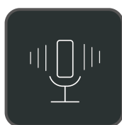
6 Mic for Superior Voice Pickup