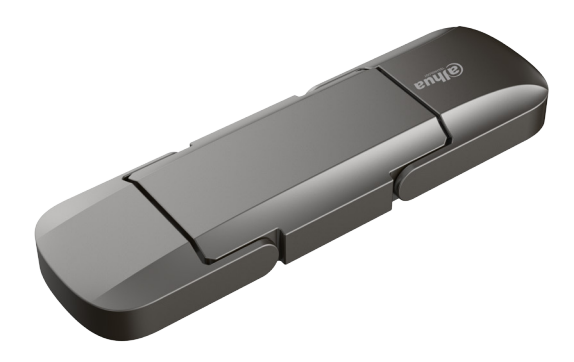
Dahua Memory S809 USB3.2 Gen2 high-speed Solid State USB Disk.