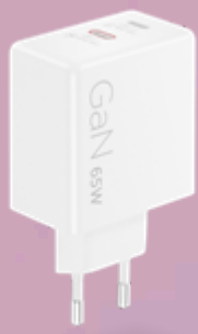
Lenovo Dual USB-C 65W GaN Charger GOA6065WEU

Please click here to view the full list of accessories.