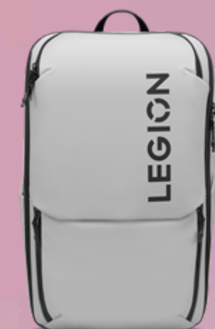
Lenovo Legion 17" Gaming Backpack GB800 (Light Gray) GX41U39300