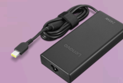
Lenovo 245W AC Adapter (Slim tip)-EU GX21T87702

Please click here to view the full list of accessories.