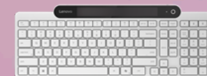
Lenovo 800 Self-Charging Bluetooth Keyboard-Russian/Cyrillic 441 GY41R69597