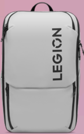
Lenovo Legion 17" Gaming Backpack GB800 (Light Gray) GX41U39300