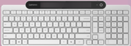
Lenovo 800 Self-Charging Bluetooth Keyboard-Russian/Cyrillic 441 GY41R69597

Please click here to view the full list of accessories.