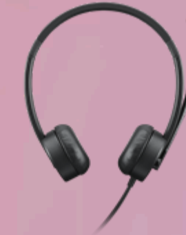
Lenovo Essential Stereo Analog Headset 4XD0K25030