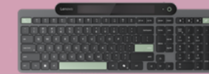
Lenovo Self-Charging Bluetooth Keyboard-French Canadian 058 4Y41R69498