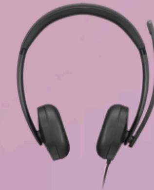
Lenovo Wired VoIP Headset 5000 4XD1R88995

Please click here to view the full list of accessories.