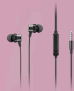
Lenovo Analog In-Ear Headphones Gen II Bulk Package (20pcs) 4XD1T54899