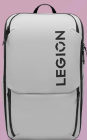
Lenovo Legion 17" Gaming Backpack GB800 (Light Gray) GX41U39300

Please click here to view the full list of accessories.