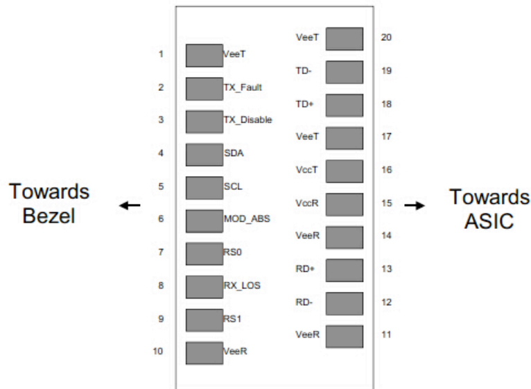
Pin-out of Connector Block on Host Board