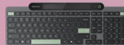
Lenovo Self-Charging Bluetooth Keyboard-French Canadian 058 4Y41R69498