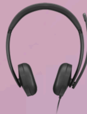
Lenovo Wired VoIP Headset 5000 4XD1R88995

Please click here to view the full list of accessories.