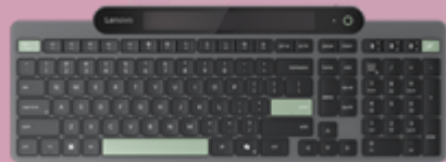
Lenovo Self-Charging Bluetooth Keyboard-French Canadian 058 4Y41R69498