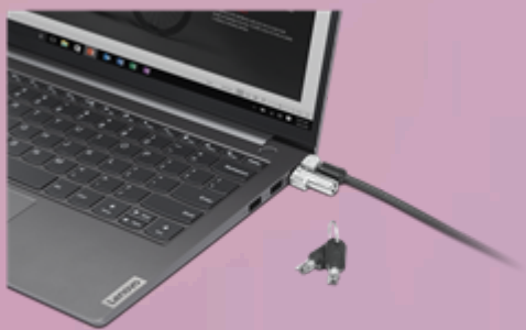
NanoSaver Cable Lock from Lenovo 4XE1L51710