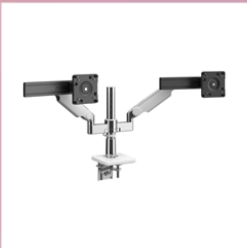
Humanscale Dual Monitor Arm White 4ZE1U10767