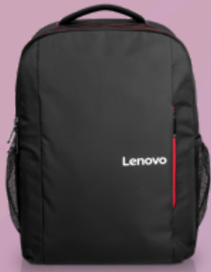
Lenovo 15.6 Laptop Everyday Backpack B510-ROW 4X41U80414

Please click here to view the full list of accessories.