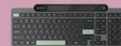
Lenovo Self-Charging Bluetooth Keyboard-French Canadian 058 4Y41R69498