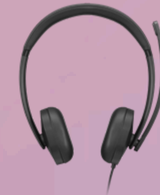
Lenovo Wired VoIP Headset 5000 4XD1R88995

Please click here to view the full list of accessories.