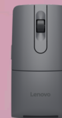
ThinkPad Bluetooth Presenter Mouse (Aura Edition) 4Y51T62792