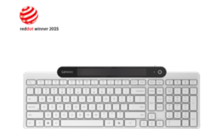
Lenovo 800 Self-Charging Bluetooth Keyboard-Russian/Cyrillic 441