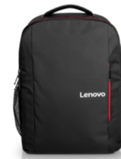
Lenovo 16" Laptop Everyday Backpack B510