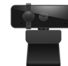
Lenovo Essential FHD Webcam Gen2