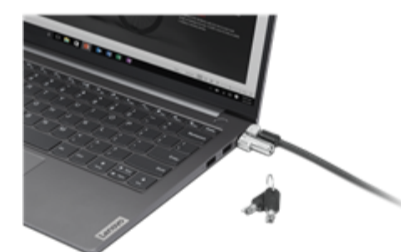
NanoSaver Cable Lock from Lenovo