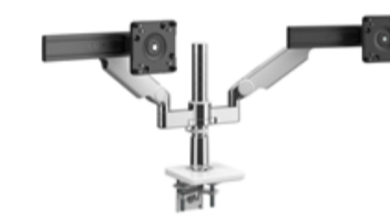
Humanscale Arm for dual monitor configuration, polished aluminum with whit...