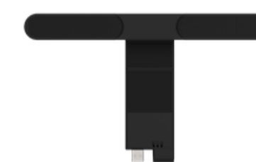
ThinkVision MS30 Monitor Soundbar