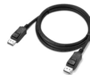
Lenovo DisplayPort to DisplayPort 1.4 cable 1.8m