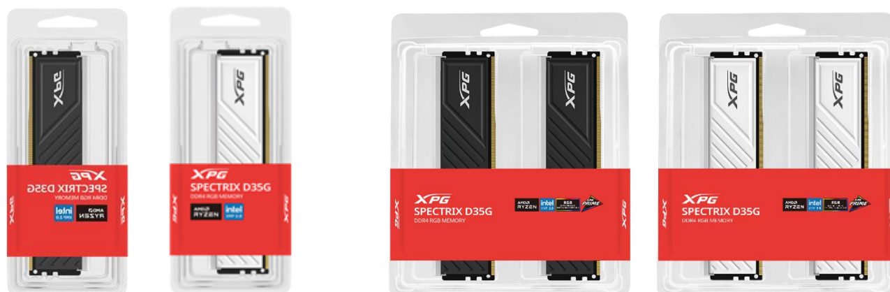
Single Tray Package