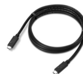
Lenovo USB 20Gbps USB-C to USB-C Cable 1.5m